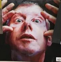
ARTIST: PAUL WRIGHT

I did some copies of selected of the inspiration images