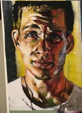
I prefer these two styles to the others.